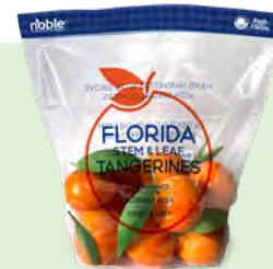
STEM & LEAF TANGERINES