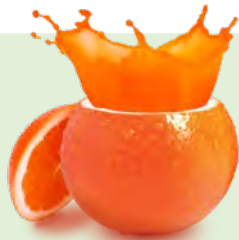
EXCLUSIVE CITRUS FOR IN-STORE JUICING