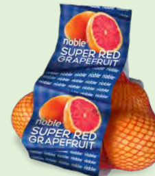
noble SUPER RED GRAPEFRUIT