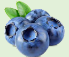
noble NEW CROP BLUEBERRIES