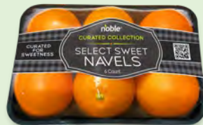
noble SELECT SWEET NAVELS