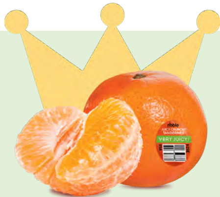
noble JUICY CRUNCH® TANGERINES