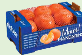
noble MMM MANDARINS