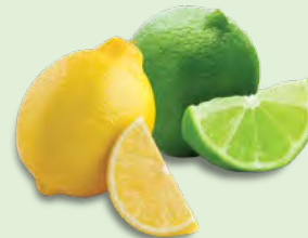
LEMON & LIMES