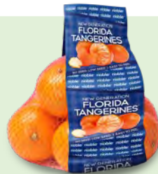
NEW GENERATION FLORIDA TANGERINES™