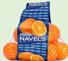
noble NAVAL ORANGES